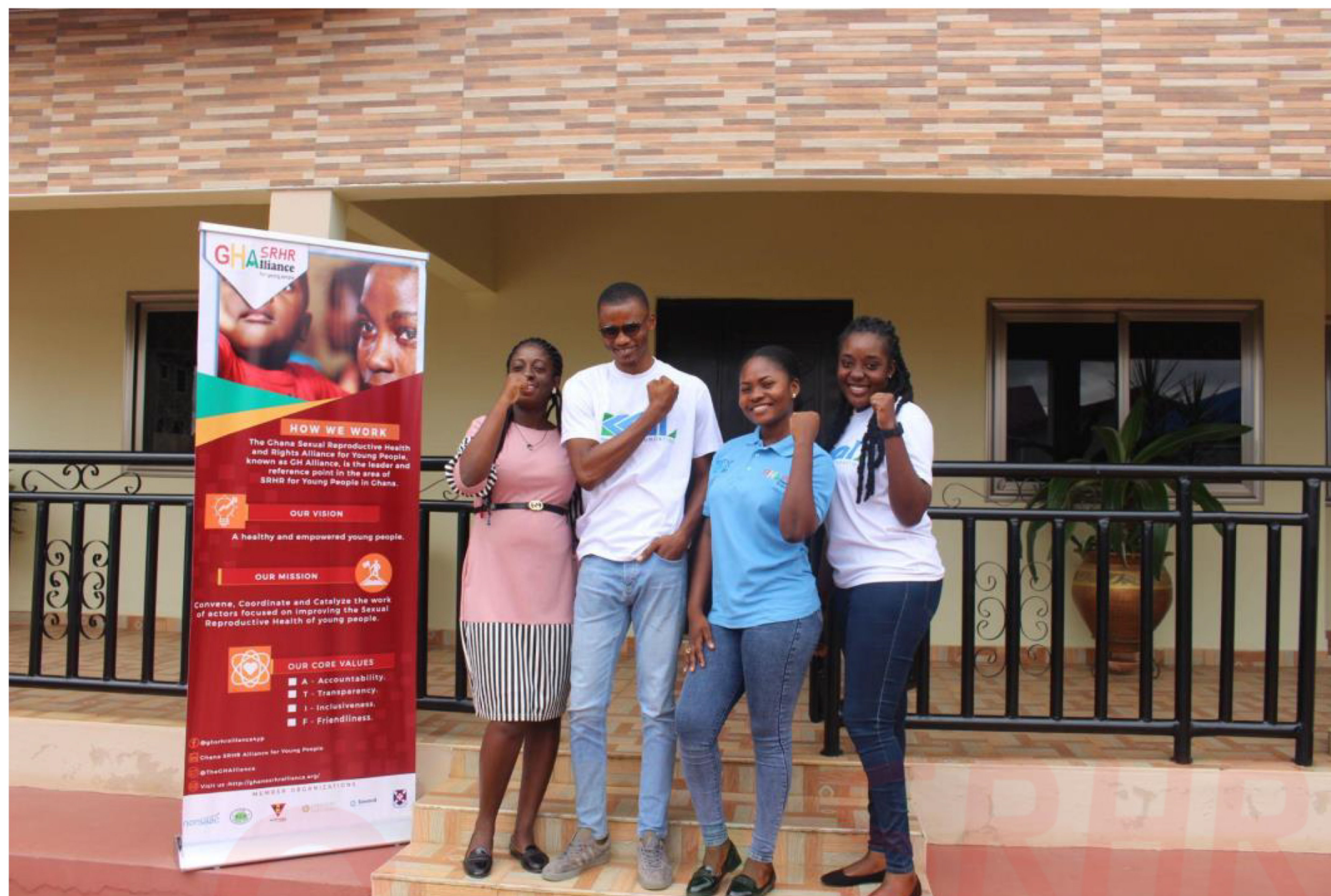
Courtesy visit by the KGL Foundation to GH Alliance