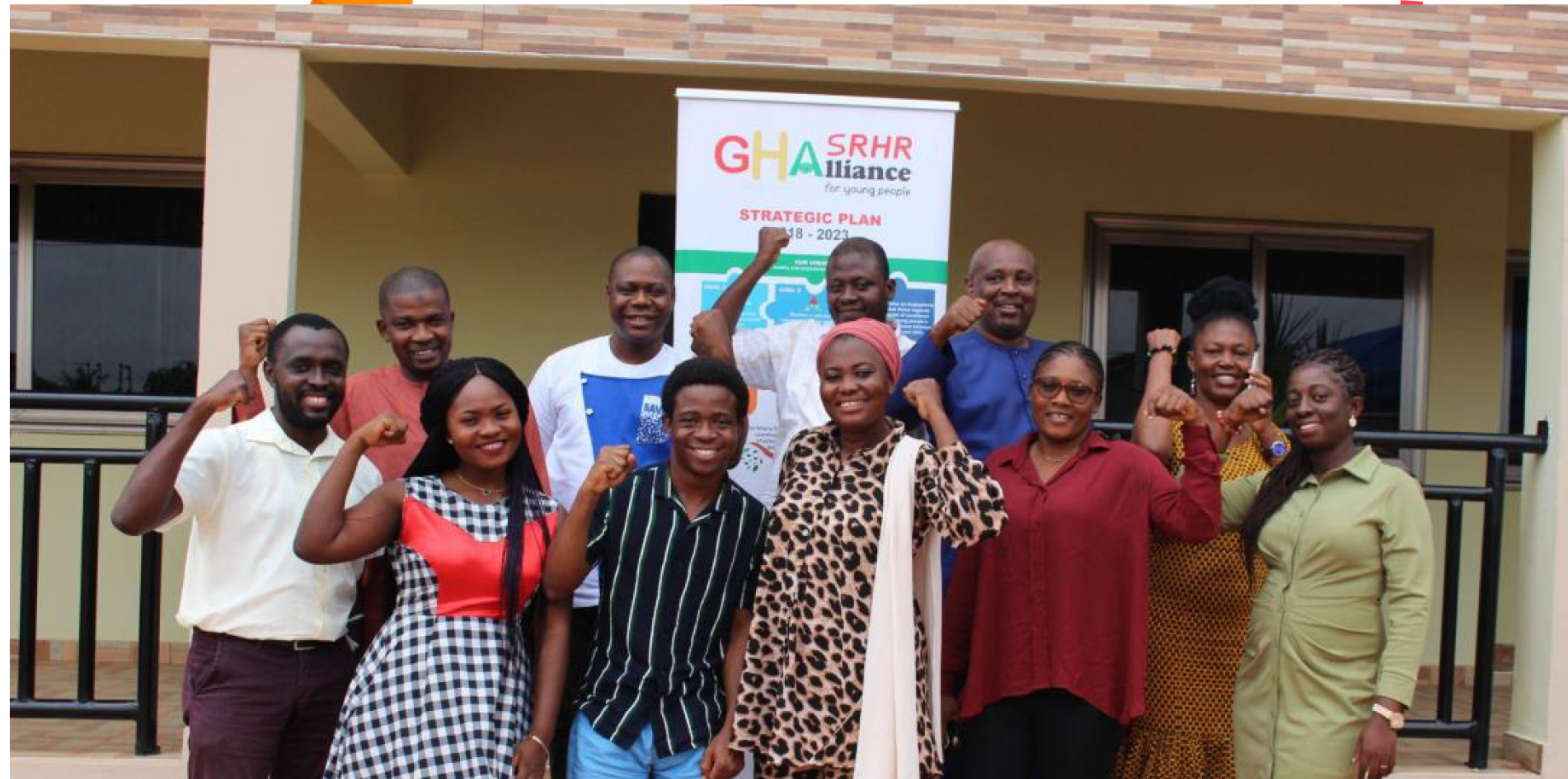
The National Governing Board (NGB) of the Ghana SRHR Alliance