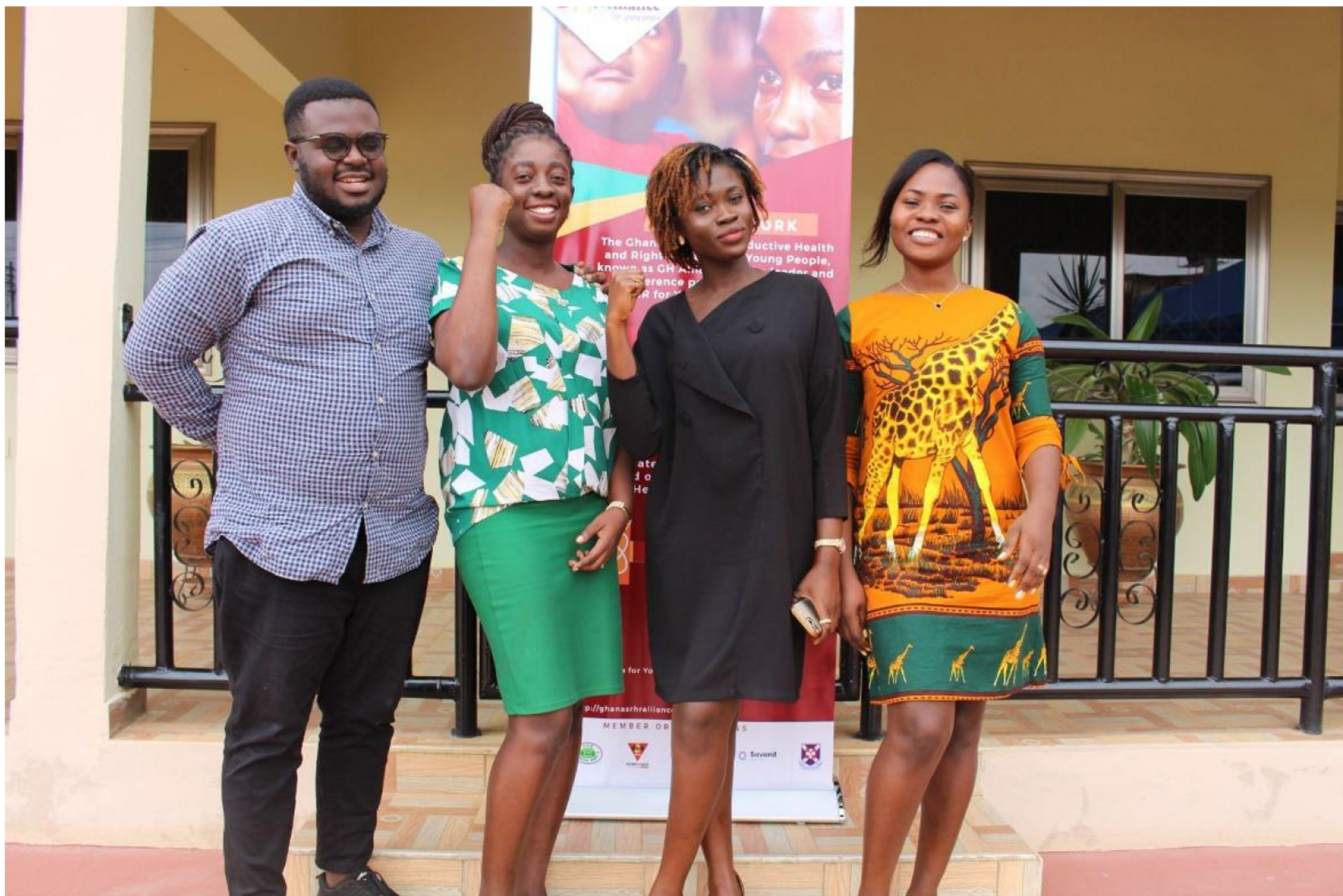
Courtesy visit by the Maries Stopes International (MSI) to GH Alliance