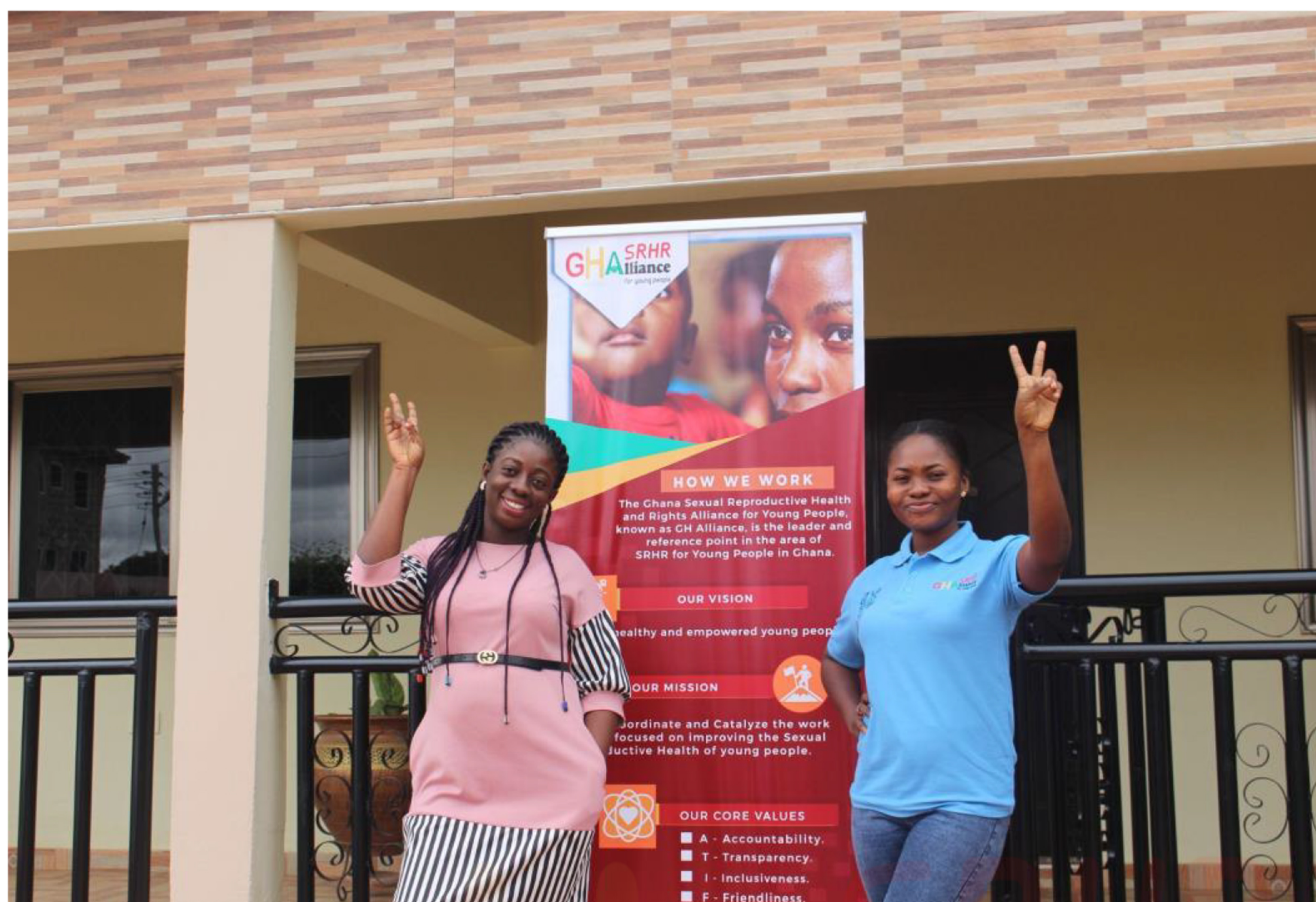
Welcome to the Secretariat of the GH ALLIANCE